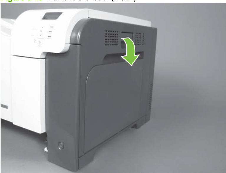
Figure 6-18 Remove the fuser (1 of 2)

2. Grasp the handles and squeeze the blue release levers.